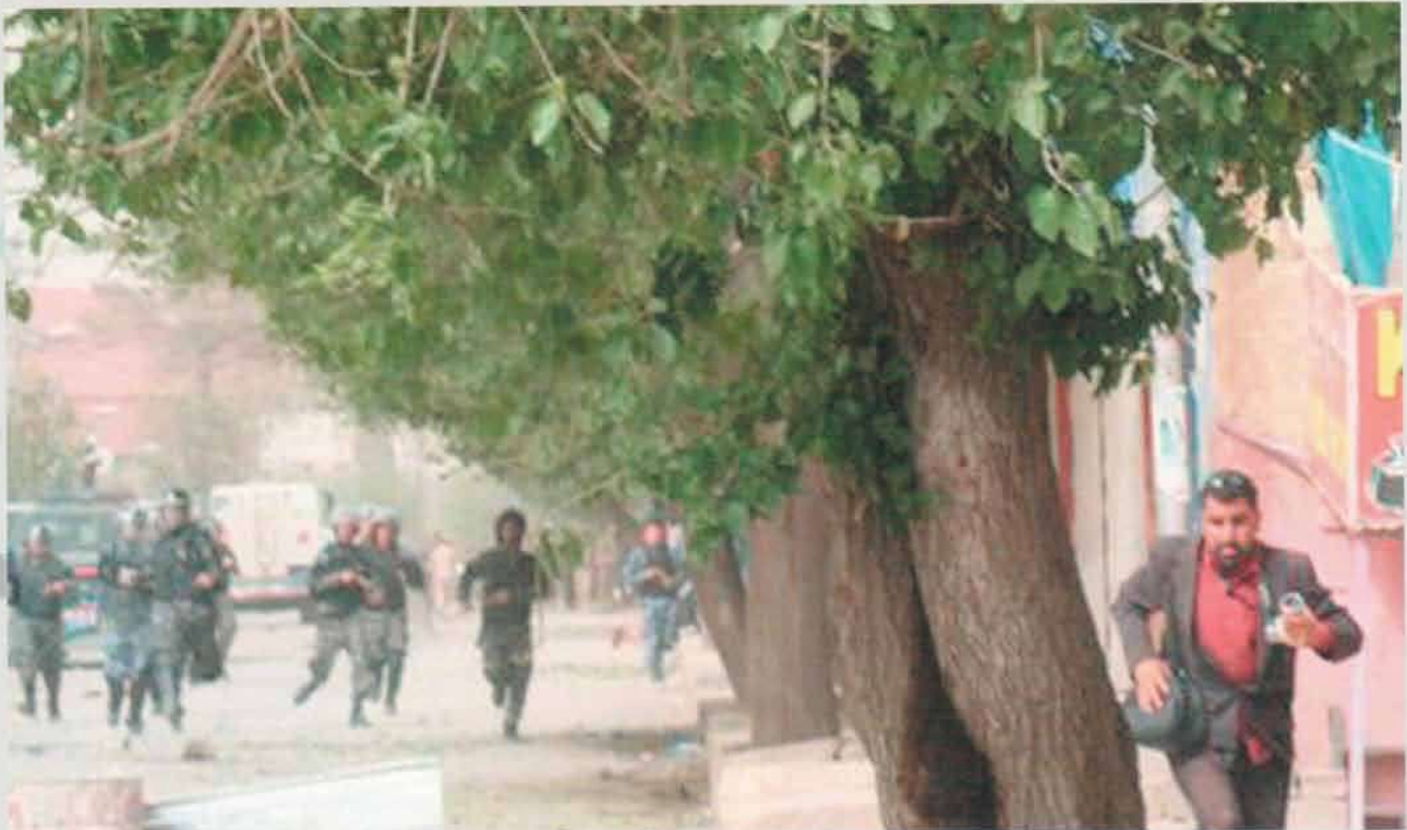
Chasing a reporter while performing his duty