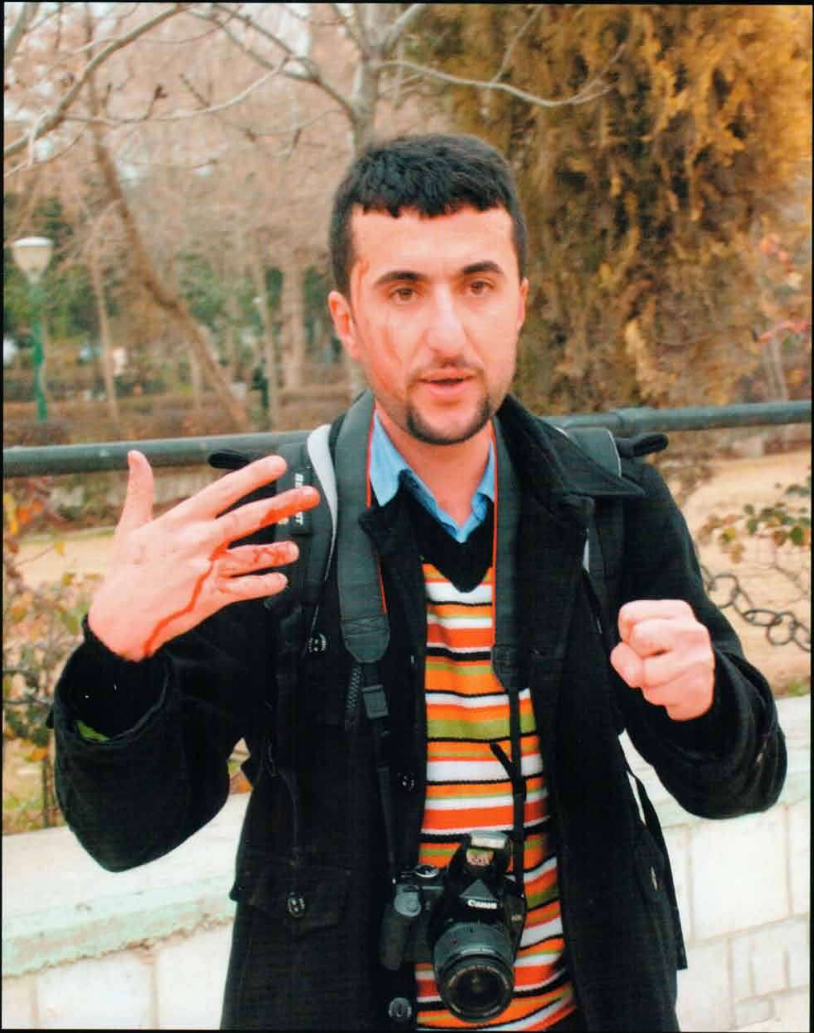
Injuring a reporter during performing his duties