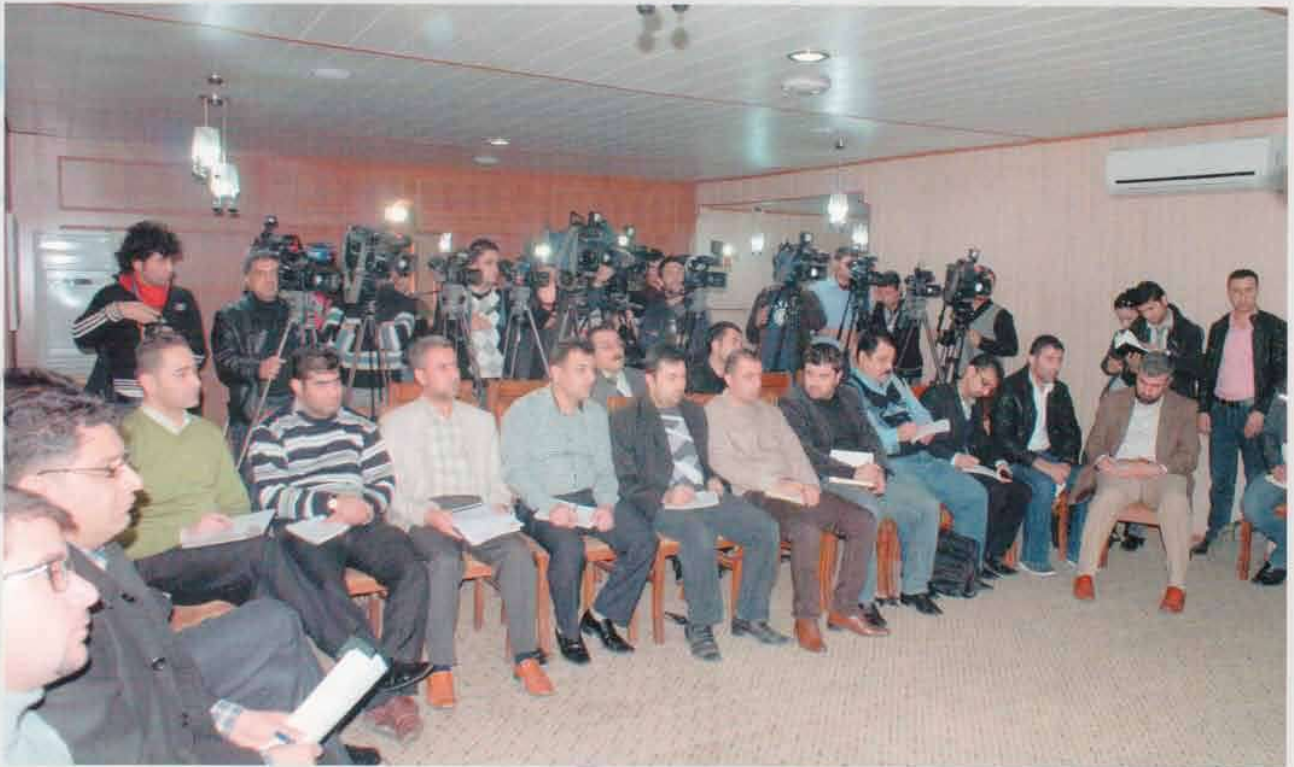
Reporters of all media channels in Kurdistan Region during the press conference of the Committee of Defending Freedom of Journalism & Journalists Rights

د ٣٠ فوایدیله سانه ١٣٤٥ هجری قمری ٩ بهمنه یی ١٣٤٤ هـ لکوری برابره داته لکوری موده له یی برابره لکوری به ستره د لکوری برابره لکوری به ستره د لکوری برابره لکوری به ستره